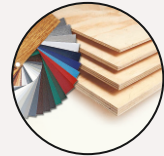
Ply / Laminates