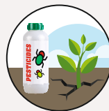
Seeds / Pesticides