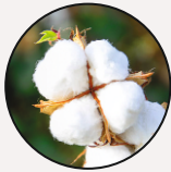
Ginners / Spinners